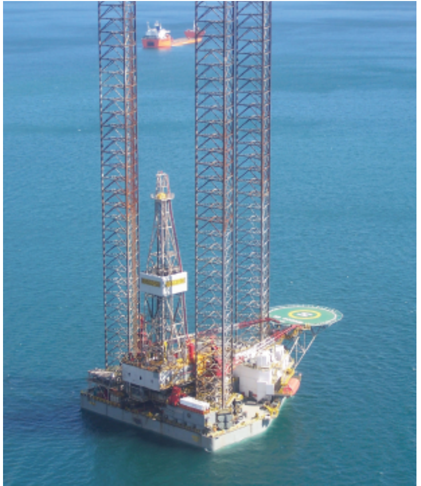
EnSCO 56 Admiralty Bay New Zealand with the heavy lift transport vessel in the background

OMS has a close working relationship with EnSCO Rig Manager Jason Morganelli and his shore base staff in New Plymouth, in fact very close in the sense that EnSCO occupy offices immediately adjacent to OMS's own offices on the 5th Floor of the IRD Building in New Plymouth. The EnSCO 56 is presently operating over the Pohokura Platform only a short distance offshore and clearly visible from the EnSCO office windows.